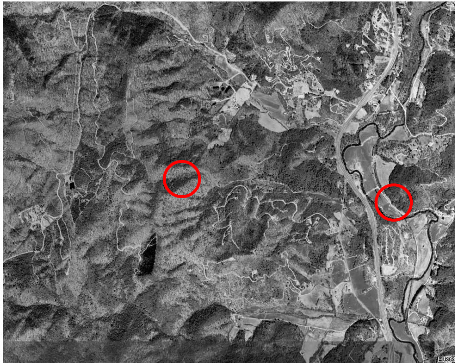
USGS Orthophotoquad: Prentiss 7.5' Quadrangle 4-14-94